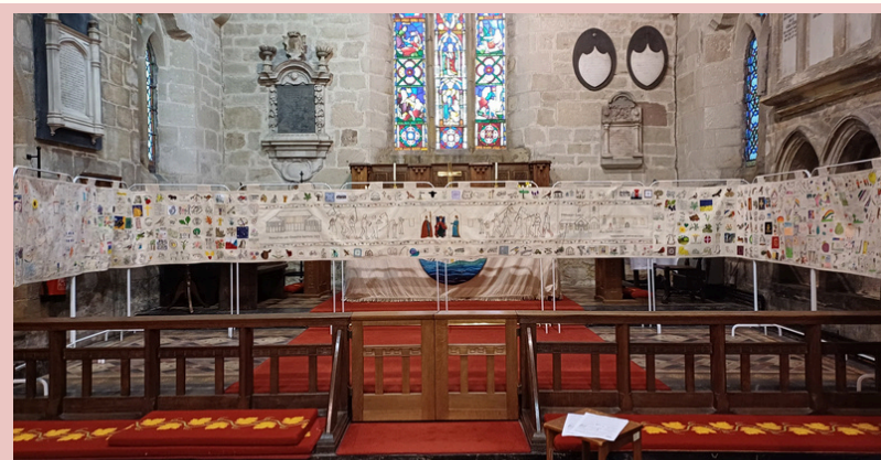
The Brailsford Bayeux at All Saints Church

An impressive creation 10.85m wide including 406 squares stitched/created by 292 people under expert guidance of local resident Laura.